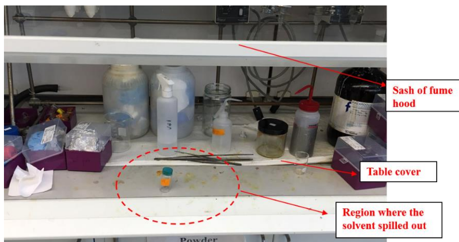
Fig. 1 Position of the broken vial in the fume hood.

I used wipes to clean most of the spilled EDT in the fume hood but found some EDT was under the white plastic table cover in the fume hood and some was spilled outside of the fume hood. I tried to clean all of them, but I could still smell the rotten odor from EDT. Thus, I used N 2 nozzle to blow towards the inside of the fume hood to dry spilled EDT quickly and made the vapor flow toward the inside of the fume hood. Unfortunately, EDT vapor flew out of the fume hood and entered the lab and office.