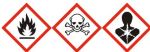
Fig. 2 Hazardous identification icon